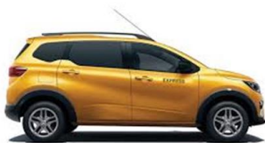
Retail: R266 999