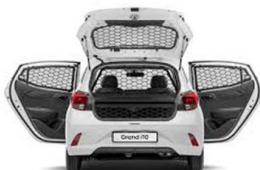
Retail: R249 500