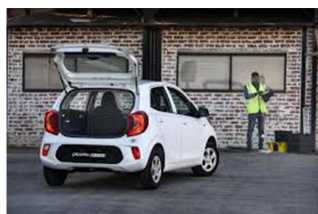
Retail: R284 900