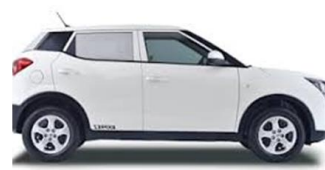
Retail: R254 999