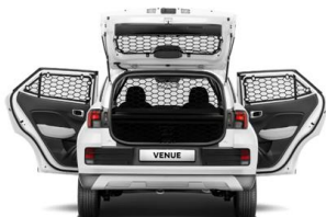
Retail: R321 500